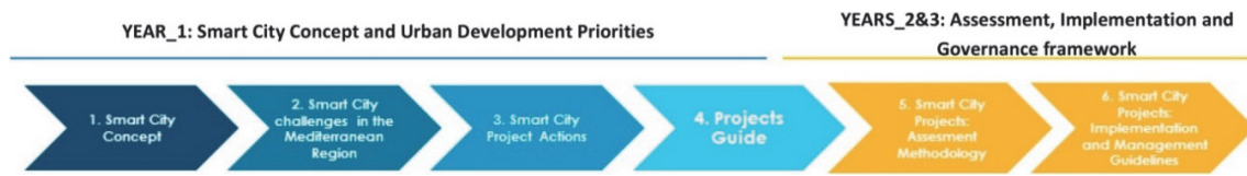
Figure 1: ASCIMER project development.

The overall goal of the ASCIMER project is to develop a comprehensive framework to help public and private stakeholders to make informed decisions about Smart City investment strategies and to build skills for evaluation and prioritization of this kind of projects, including solving difficulties regarding deployment and transferability.